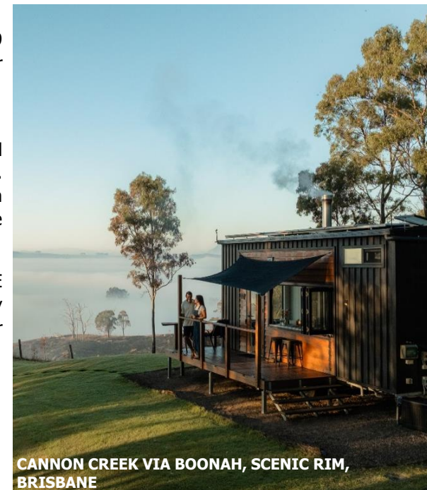
CANNON CREEK VIA BOONAH, SCENIC RIM, BRISBANE