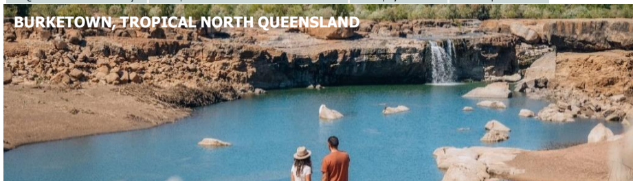
BURKETOWN, TROPICAL NORTH QUEENSLAND