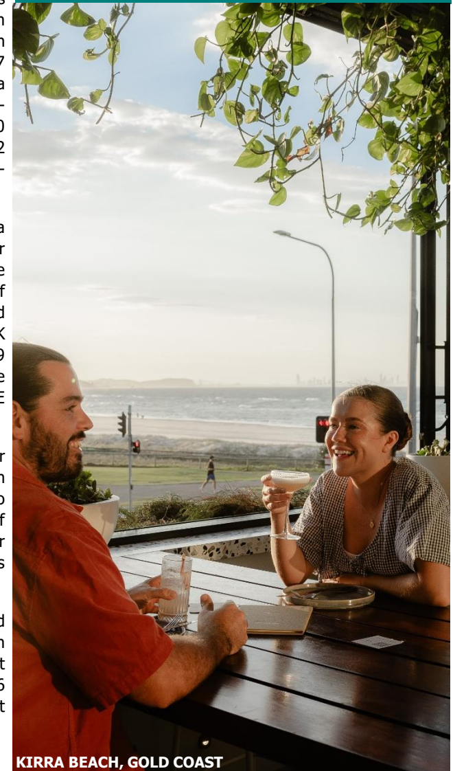
KIRRA BEACH, GOLD COAST