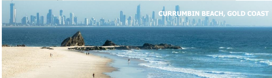
CURRUMBIN BEACH, GOLD COAST