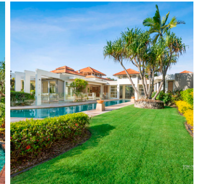
Noosa Springs Golf & Spa Resort