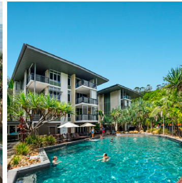
Peppers Noosa Resort & Villas