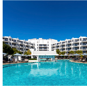
Sofitel Noosa Pacific Resort