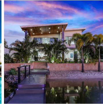
Niche Holidays Noosa