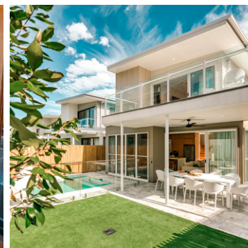
Essence Peregian Beach