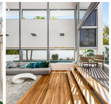
Noosa Luxury Holidays